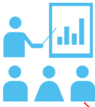
D&I: The UnConference