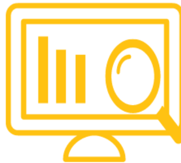
Measurement & Analytics