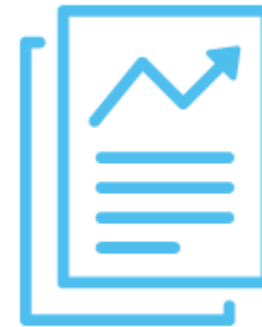
Reports and toolkits