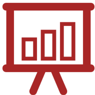
Workshops and training