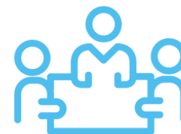
Employment Equity practitioners group (EEPG)