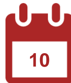
Community of practice events